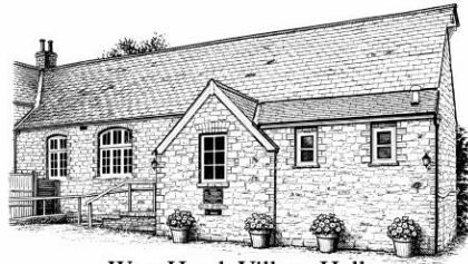
West Hatch Village Hall